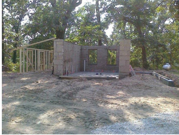
Start of construction preserving the original stone walls