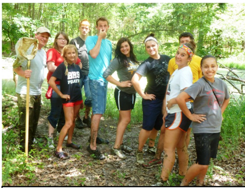
GLADE'rs show off their swamp-mucking gams

In addition to major support from MSU-BSFS and GOAS, GLADE 2012 was largely funded by grants from the Community Foundation of the Ozarks, Audubon Society of Missouri, Ozarks Water Watch, and White River Valley Electric Cooperative. Additionally, support from numerous private donors and local businesses including Great Southern Bank and K-Dock Marina helped make GLADE 2012 possible.