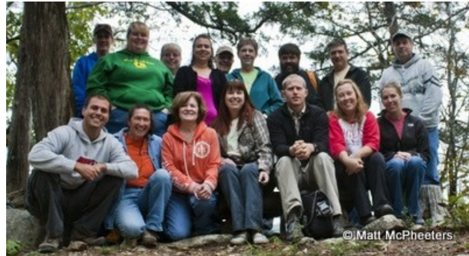
GLADE staff and the GLADE Mentor Development Teachers

The Rural Schools Partnership of the Community Foundation of the Ozarks provides Community Conservation Grants to GLADE graduates and their mentors. The GLADE graduates apply for funding to purchase supplies and equipment for their community projects. All project proposals are reviewed by GLADE staff and the applicants provide an accounting of their expenses related to their project completion.