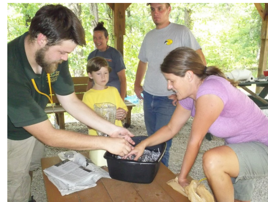
Plants & Ozarks Culture students work with Springfield-Greene County Parks campers to make new paper from old

Everyday Botany for Educators is the summer 2013 BSFS plant-related course offering. Sequenced registration opens April 1, 2013.